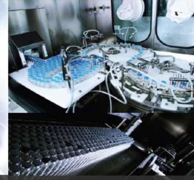
Freeze Dryer with Automated Loading Unloading System