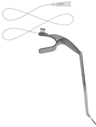
Figure 1 Surfactant application device (Neofact®).