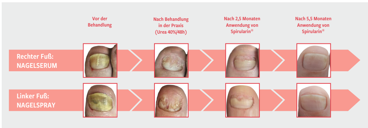
Praxiskonzept zur Behandlung von Nägeln mit Nagelpilz nach A. Niederau – Vergleich von Nagelserum mit Nagelspray am selben Patienten.

(40% paste in aqueous medium) to the affected nails for 2-3 days. Urea selectively penetrates the remaining damaged parts of the nail and softens these remaining parts thanks to its strong water-binding capacity. The healthy part of the nail remains completely intact. I can then easily remove these portions after opening the dressing.