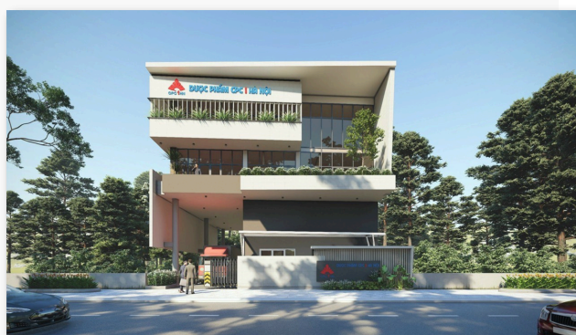
Branch office in Daklak