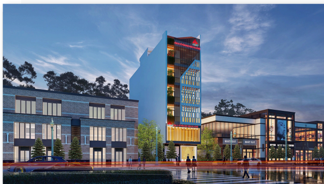
Branch office in Da Nang

With the development of Salesmen quantity and quality, CPC1HN's products is distributed to every province in Viet Nam. And now, we have more than 10 branches offices throughout of Vietnam region: Hanoi, Da Nang, Ho Chi Minh, Khanh Hoa, etc.