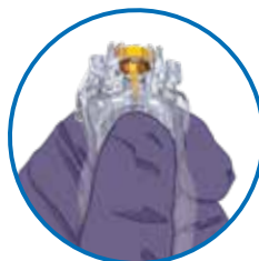
PUSH THE SLIDER