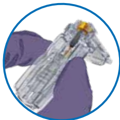
HOLD THE BODY