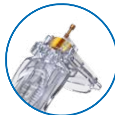
GET THE SCREW