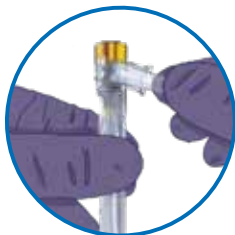
TILT LEFT OR RIGHT