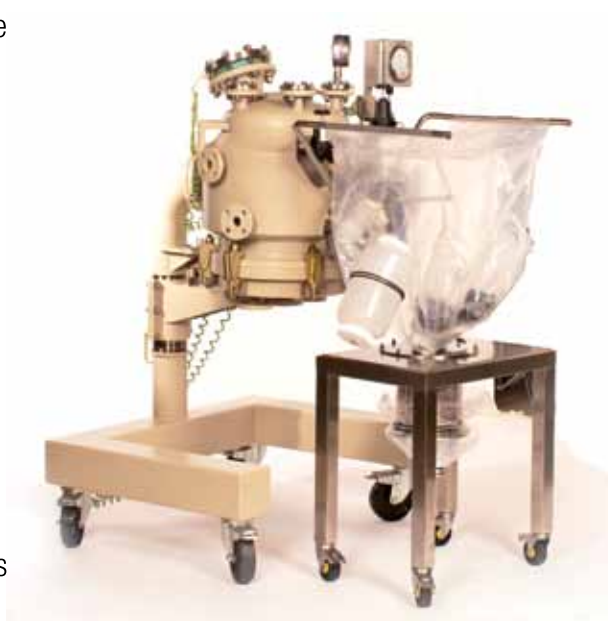
0.125m 2 PFA coated