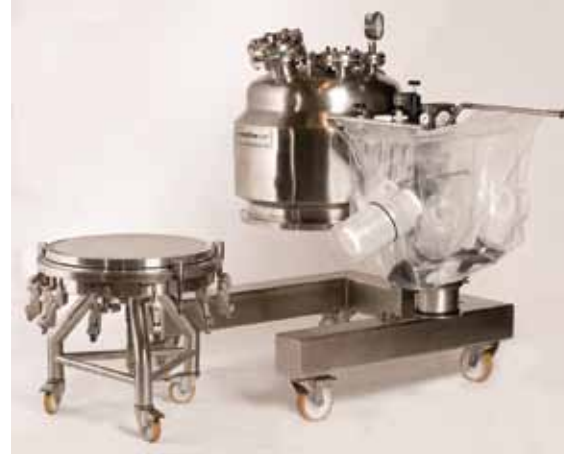
Stainless Steel 0.3m 2 simplefilter