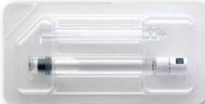
Example: Blistered sWFI-Syringe 3.0 ml