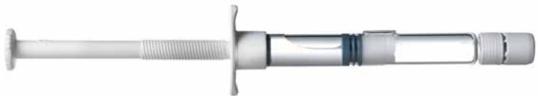
Example: Vetter Lyo-Ject® dual-chamber syringe 1.0 ml

Vetter's patented dual-chamber technology allows different ingredients and solvents to be prefilled and stored separately, then easily mixed and administered as needed. Dual-chamber systems can be used for lyophilized/solvent drugs, and liquid/liquid drugs and offer your sensitive compound many advantages.