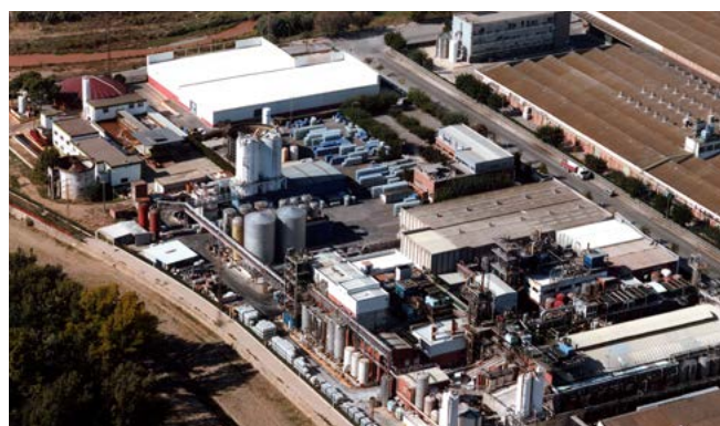
Corbion factory in Spain

Corbion has a wide range of natural minerals that are suitable sources of additional nutrients in all types of supplement. Our products are used for mineral and electrolyte delivery. Corbion's mineral lactates and gluconates are characterized by good solubility, high bioavailability and neutral flavor. Our range incorporates directly-compressible product grades that are easy-to-process (non-hygroscopic, free-flowing powders).