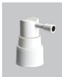
Throat Adapter Medium