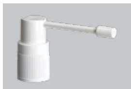
Throat Adapter Long