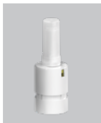
Dose Counter 1