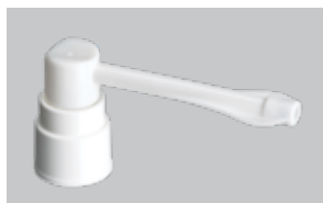
Throat Adapter Long with Wings