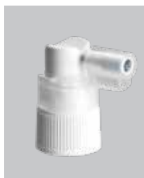
Throat Adapter Medium + Protection