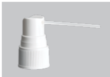
Spray Head with Capillary Tube 4