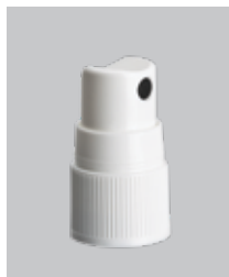
Spray Head 16 mm