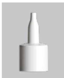
Shroud 20 2