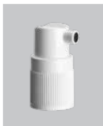
Throat Adapter Short