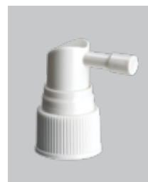
Spray Extender 2