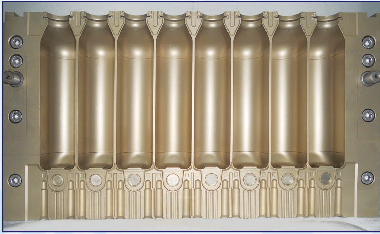
BLOW FILL SEAL MOULDS