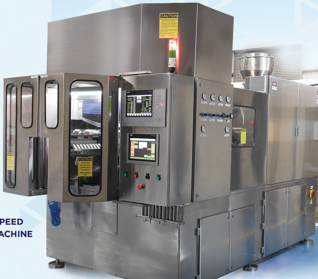
COMPACT HIGH SPEED BLOW FILL SEAL MACHINE