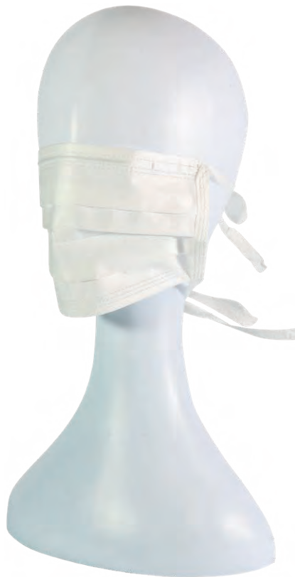
FACEGUARD 1 FACEMASK WITH TIES