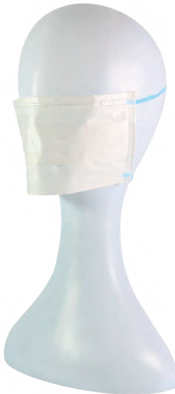
FACEGUARD 2 FACEMASK WITH EARLOOPS