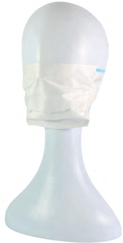
FACEGUARD 3 FACEMASK WITH HEADLOOPS