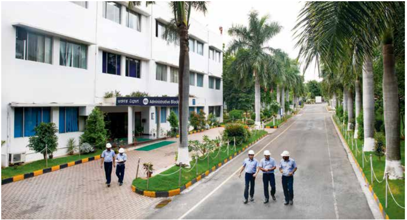
Manufacturing facility at Nanjangud, Mysore, India