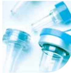
PORTS & CAPS