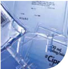
IV & PHARMACOLOGICAL APPLICATIONS