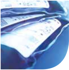
BLOOD & BLOOD COMPONENTS