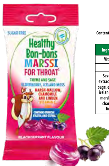
Content of the individual ingredients in the recommended daily dosage of the product:

Recommended to: adults and children over 3 years