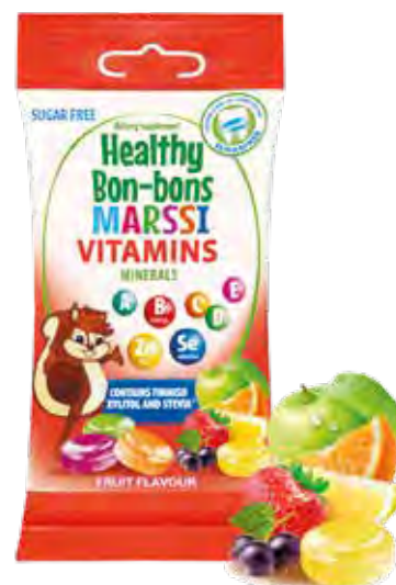
Content of the individual ingredients in the recommended daily dosage of the product:

Recommended to: adults and children over 3 years