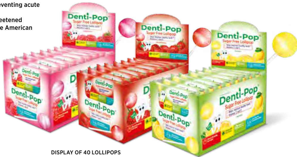
DISPLAY OF 40 LOLLIPOPS