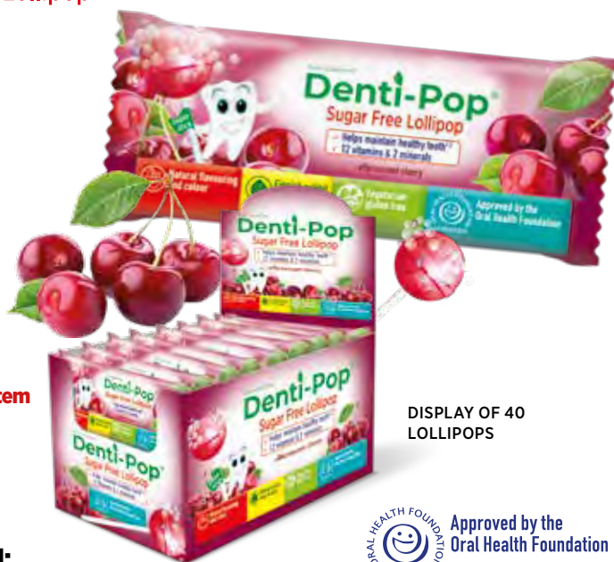
DISPLAY OF 40 LOLLIPOPS