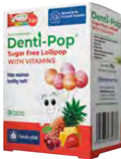
MIX OF 5 FLAVOURS