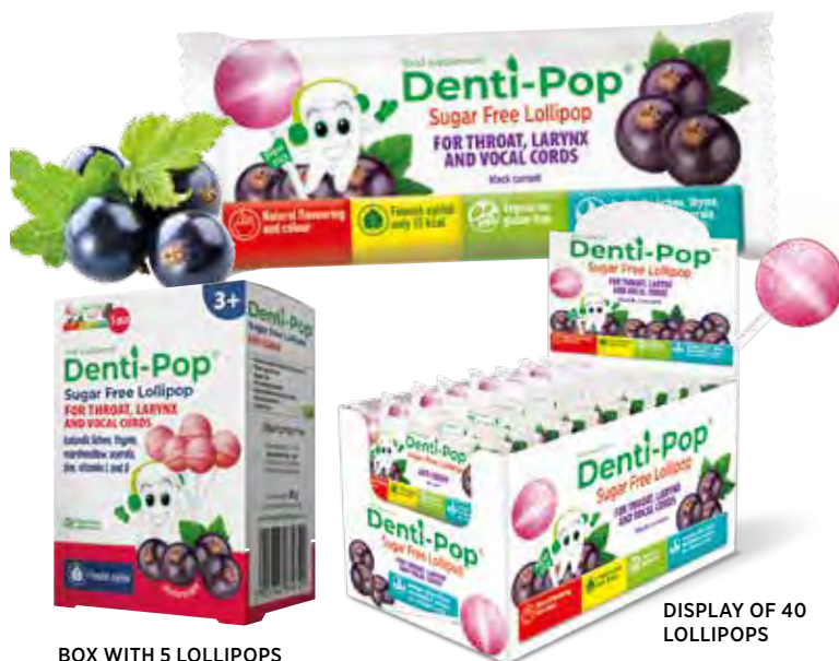
BOX WITH 5 LOLLIPOPS

Recommended to: adults and children over 3 years