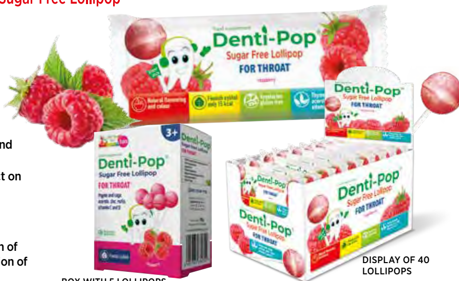
BOX WITH 5 LOLLIPOPS

Recommended to: adults and children over 3 years