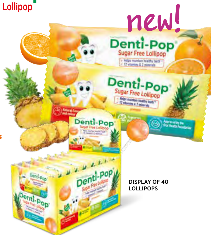
DISPLAY OF 40 LOLLIPOPS

Content of the individual ingredients in the recommended daily dosage of the product: