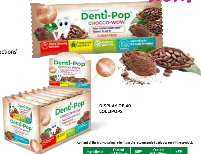
DISPLAY OF 40 LOLLIPOPS

Content of the individual ingredients in the recommended daily dosage of the product: