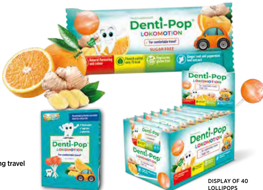
BOX WITH 5 LOLLIPOPS

Recommended to: adults and children over 6 years