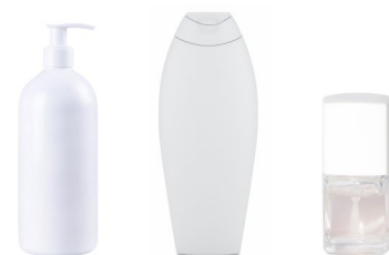
Body care and nail polish