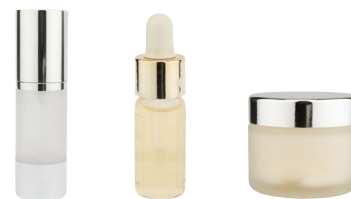
Perfumes and creams

Diligent processing of cosmetic products - also in the luxury segment