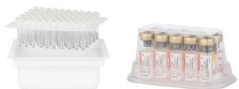
Nest and bulk handling