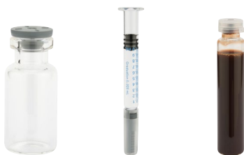
Vials, syringes and cartridges

Aseptic and non-aseptic processing of pharmaceutical products