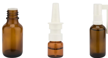
Drops and sprays

Flexible processing of healthcare products