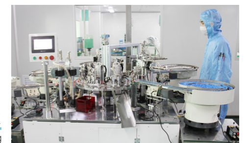
喷雾泵自动组装 Automatic Sprayer Assembling