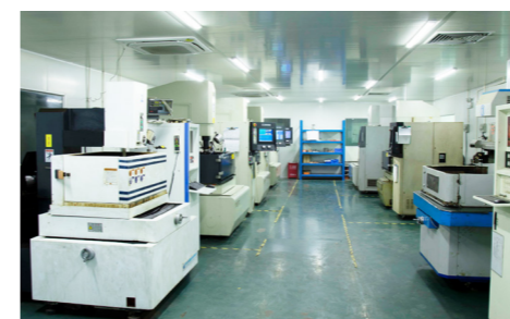
产品研发 R&D Workshop