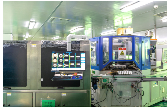
塑料瓶视觉检测 Bottle Visual Inspection