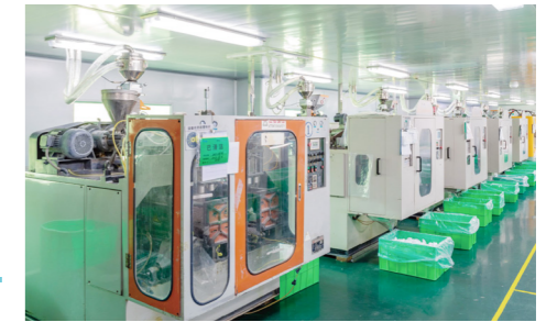
吹瓶车间 PE Bottle Blowing