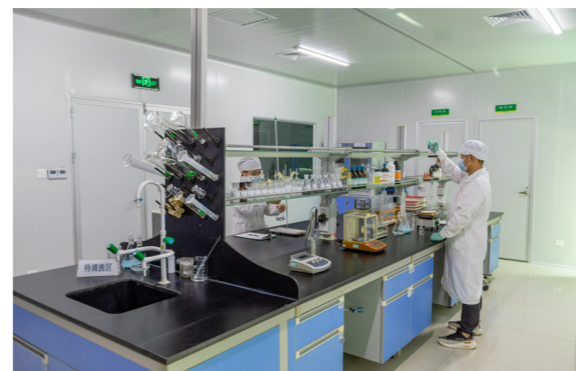
化学实验室 Chemical Lab