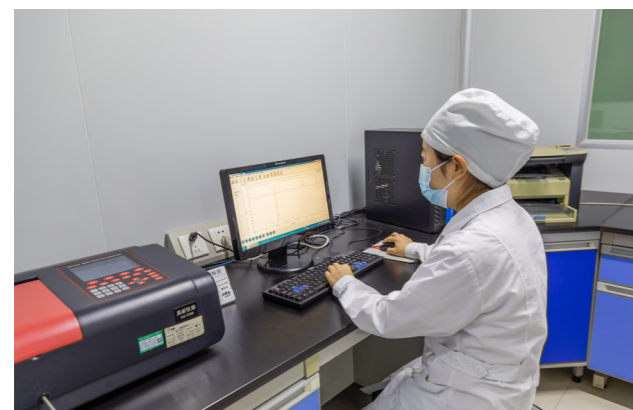
精密仪器室 Precise Instrument Lab