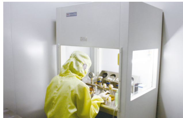
菌检室 Bacterium Inspection