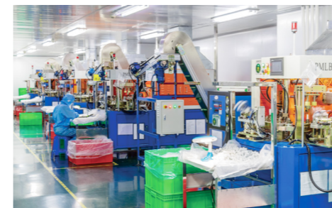
拉吹车间 PET Bottle Blowing