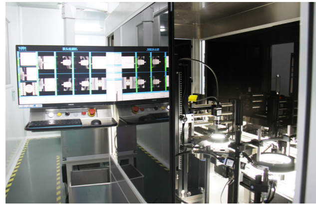
喷雾泵视觉检测 Sprayer Visual Inspection