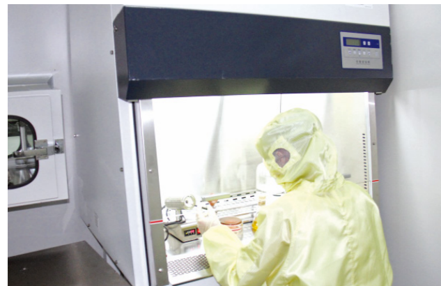
阳性对照室 Positive Bacteria inoculated Room