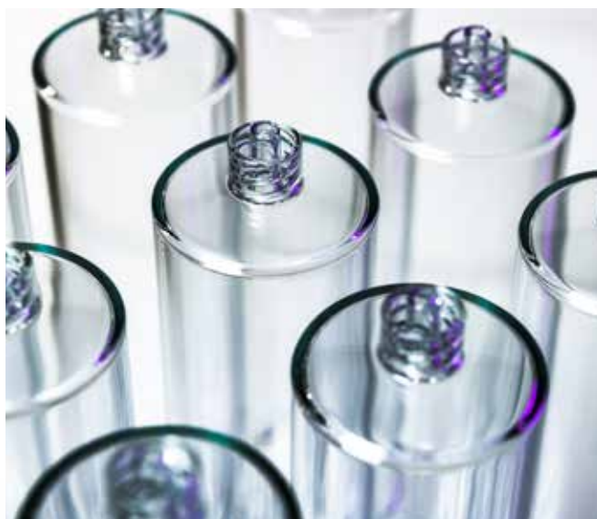
Prefillable syringes Schott TopPac™, manufactured by Schott Glas

For this reason, a number of TOPAS® COC grades have been studied in a biocompatibility test program. The TOPAS® COC grades studied meet the requirements of US Pharmacopoeia XXIII Class VI and ISO 10993. Certificates are available on request.