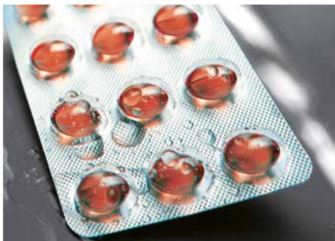
Blister packaging film made with TOPAS® COC

With its remarkable property profile compared with known plastics, TOPAS® COC offers new options for these applications.