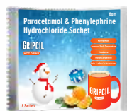
Liquid & Solid Sachet