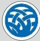
Ministry of Health Ethiopia