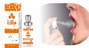
Oral Spray & Syrup