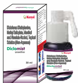
Spray & Solution