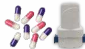
Dry Powder Inhaler Capsule