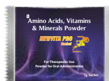
Liquid & Solid Sachet