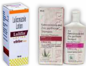
Lotion & Shampoo