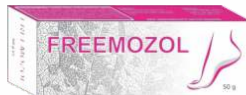
Cream & Gel