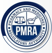
Pharmacy and Medicines Regulatory Authority MALAWI