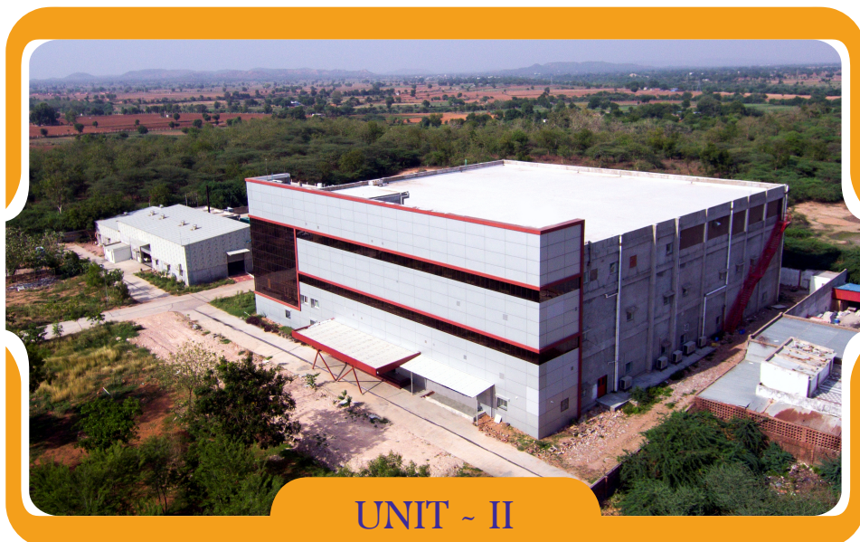
UNIT ~ II

Montage Laboratories established in 1991 and situated at Himatnagar, Gujarat, India . The plant is surrounded by greenery, reserved forest area, totally pollution free, and a highly hygienic area. We are proud to get identified as the unique pharmaceutical provider in injections and some other forms in global arena. With the commitment of “ Making Available Medicines at Affordable Prices ”. We have state-of-the-art, fully automated, ultra modern manufacturing unit in compliance with the latest cGMP guidelines, conforming to ISO 9001:2015 and D&B Certified Company.