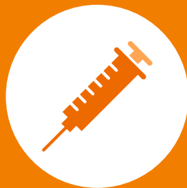
Pre-Filled Syringes (PFS)