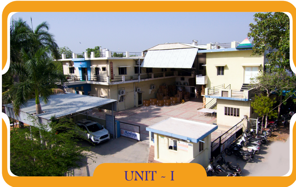
UNIT ~ I