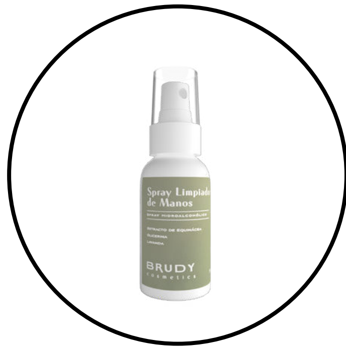
HAND CLEANSING SPRAY