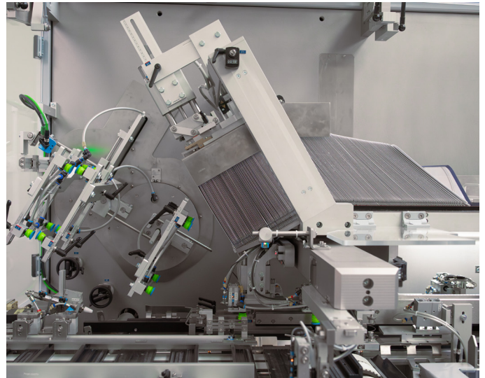
The carton erector: within fractions of a second, the box is folded and positioned perfectly to be filled in synchronization with the insertion process.

In the insertion station, a servo-driven infeed pusher carefully and precisely guides the bucket's contents into an already erected folding box. The pre-glued folding boxes, securely held in place by the chain feeder, are picked from a large folding box magazine located above the folding box transport area using vacuum suction. "The magazine is designed in such a way that it can be safely refilled during operation," emphasizes Jörg Aurbacher. "But the real feat is performed by the carton erector: within just fractions of a second, the complex folding box is erected and positioned perfectly to be filled in synchronization with the insertion process. This is the result of our extensive motion studies in the CAD system as well as hands-on testing with our assembly technicians at the real machine."