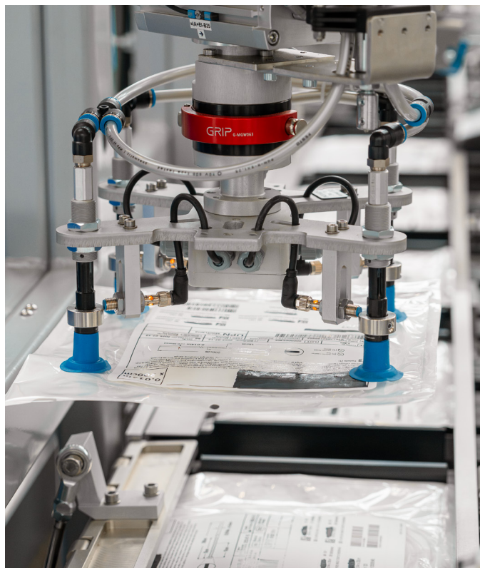
High-precision gripping with laser distance sensors: a pick & place tool specially developed for sensitive pouches.

Jörg Aurbacher points to the gripping tool that removes the pouches from the transport box and securely places them onto a bucket in the transport chain. "This is a pouch-specific pick & place tool. Due to the sensitivity of the pouches, we have equipped the top-down gripping tool with high-precision, fast laser distance sensors. These sensors continuously measure the distance during the insertion process to prevent damage. Additionally, the suction force is continuously monitored. If it increases unexpectedly, the picking process is immediately interrupted before any damage to the product can occur. The suction plate on the gripping tool is also designed to disengage to protect against worst-case scenarios, ensuring maximum safety."