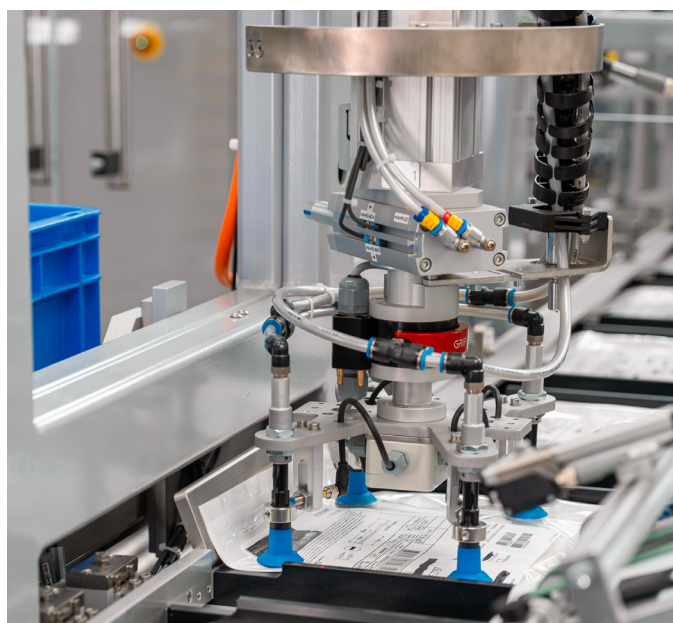
Customized automation: the correctly oriented pouch is placed on the correct accompanying documents and carefully folded at one end.