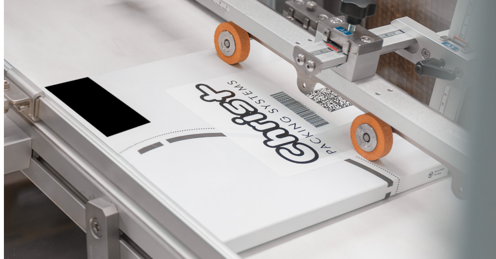
Complex secondary packaging: a 37 cm long U-shaped label is to be automatically applied to the folding box.