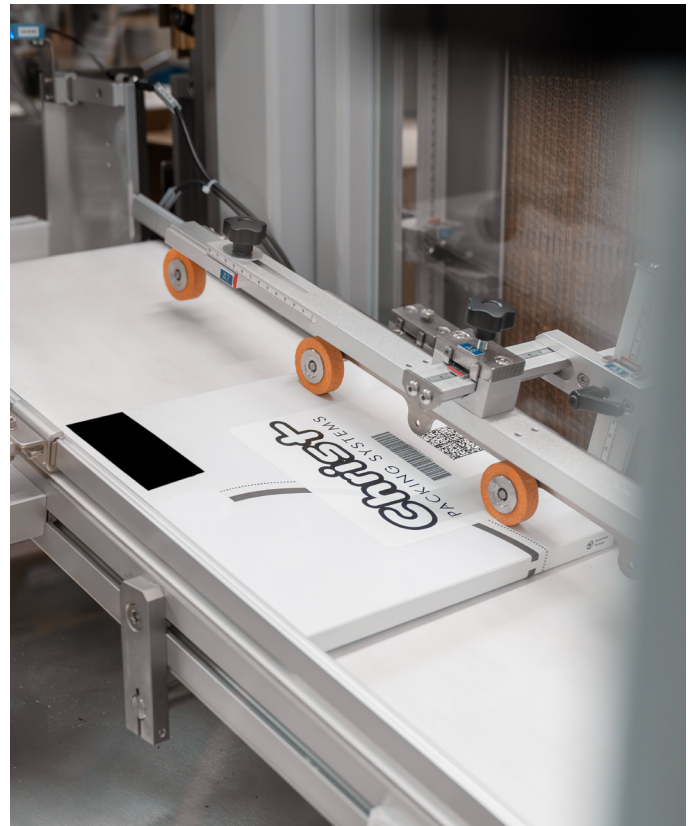
The closed, labeled and sealed folding boxes are conveyed to the downstream case packer.

In the cartoner, various sensor systems are used depending on the project – ranging from simple light sensors to complex camera-based pattern recognition. "These systems check serial numbers, print quality, flap closures, barcodes, and labels, ensuring the presence of the correct documents, security labels, and folding boxes," explains Florian Haertinger. He adds, "Any errors in the packaging process result in immediate rejection. This guarantees maximum process reliability and quality – just as our customers expect."