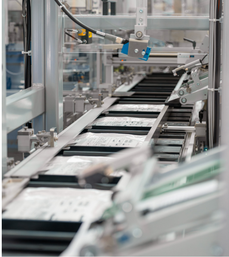
Suitable sensors are essential for reliable automation.

“The transition from primary to secondary packaging is often the most critical stage for our customers. And it is precisely at this point – when the product is placed into the folding box – that a simple standard machine is no longer sufficient. Only a cartoner specifically customized to the product can deliver the desired outcome,” says Jörg Aurbacher.