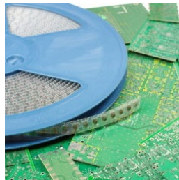
Electronics and Semiconductors