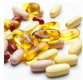
Health and Personal Care

BUSINESS SEGMENT CARGO & DEVICE PROTECTION BU ADSORBENTS & ADDITIVES