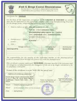
WHO - GMP