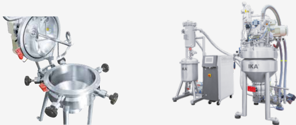
Basic Version of the Conical Mixer

The Conical Dryer CD and the Conical Mixer CM are available in various different versions and with the widest variety of options. The cost-effective basic models permit execution of standard processes, and their space-saving design is of particular benefit. Both machine types can be upgraded with a wide variety of options for more complex tasks and for greater operator comfort. The lid tilting and vessel slewing function ensures efficient mixing or drying and provides user-friendly access to the inside of the vessel. Fitting of several movable spare vessels ensures maximum process flexibility. Additional options are listed on Page 8.