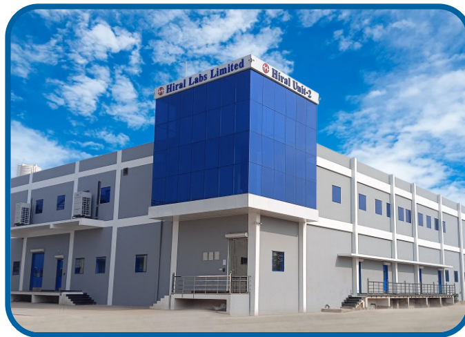
Plant-2 Oncology Injections