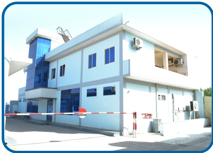
Plant-1 General Drugs

Manufacturer of Finished Dosage Forms Drugs, Oncology Injections & Nutraceuticals