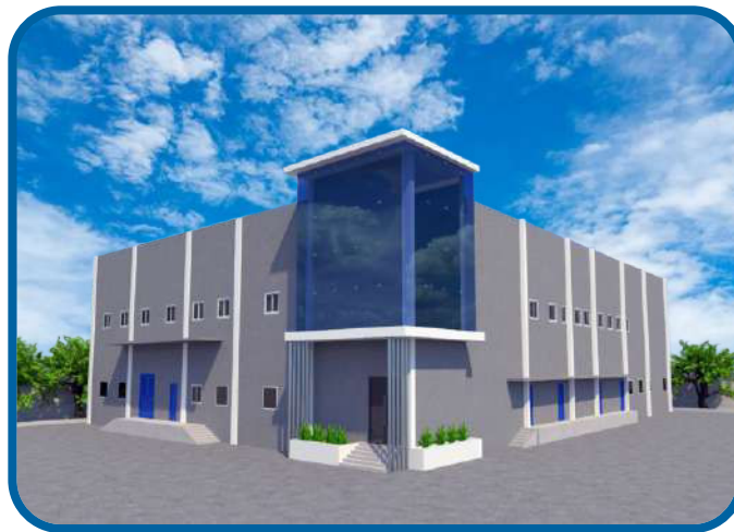
Unit-2 Oncology Injections