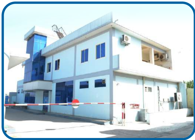
Unit-1 General Drugs

Manufacturer of Finished Dosage Forms Drugs, Oncology Injections & Nutraceuticals