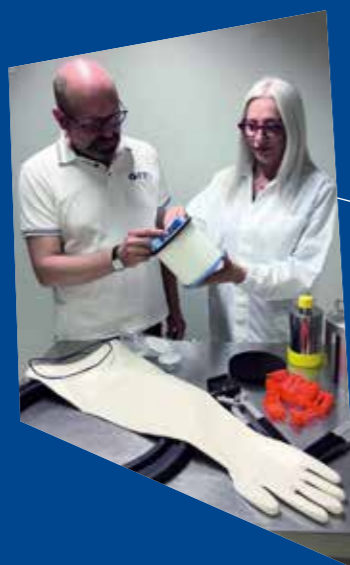
Spare parts planning and Preventive maintenance

We deliver both containment and micronization complete training tailored on your specific requests and challenges.