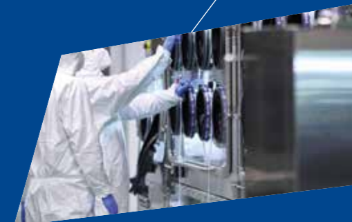
On-site & Remote Assistance