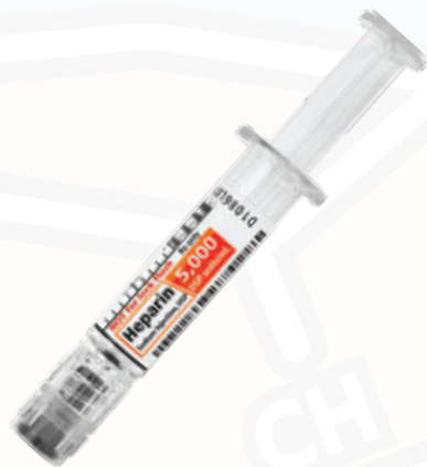
PFS (Pre-filled Syringe)