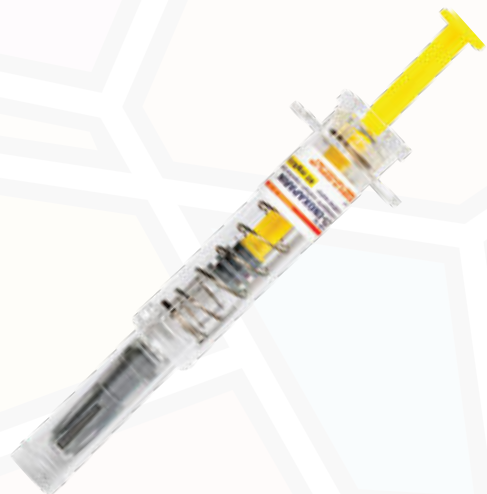
PFS (Pre-filled Syringe)

Disclaimer : The Seller does not warrant that the use or sale of the products delivered hereunder will not infringe the claims of any patents covering the product itself or the use thereof in combination with other products or in the operation of any process.