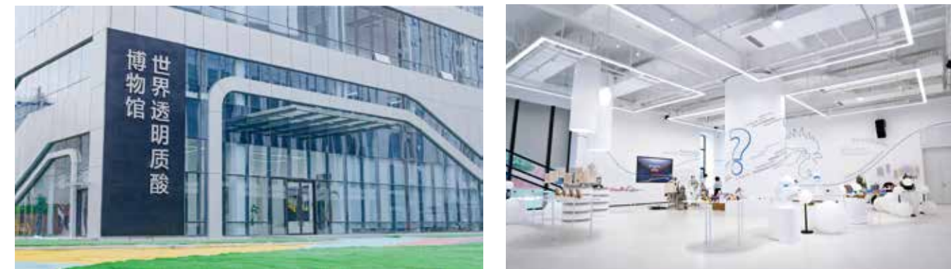
Exhibition of Discovery, Development, Production and Application of HA