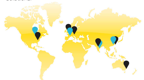
📍 Laboratory Services 📍 Assurance Solutions

You can rely on our global network of experts, laboratories and specialists to deliver support including analysis, bioanalysis, formulation development, biologics characterization, specialist inhalation development expertise, regulatory consultancy, risk assessment, auditing and supply chain management solutions.