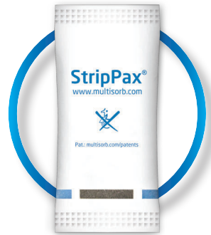
3 gram 10.0mm W x 13.0mm L x 3mm D