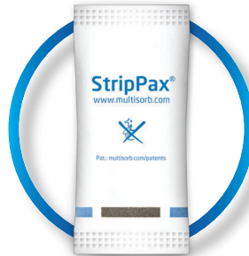
2 gram 8.0mm W x 15.0mm L x 2.5 mm D