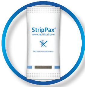
1 gram 5.0mm W x 10.0mm L x 2mm D