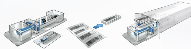
Multi blister pack with folded patient record label