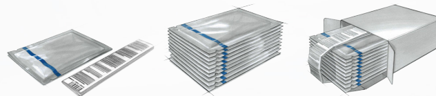
Sachets with leaflet in side-loading box