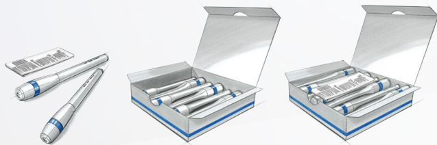
Medical pens with leaflet in top-opening box