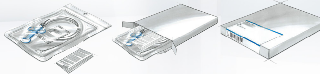
Sealed medical pouch with leaflet & labelling