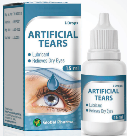
POLYVINYL ALCOHOL & POVIDONE i-Drops