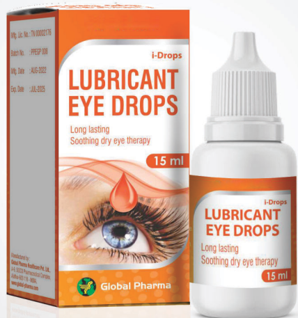
POLYETHYLENE GLYCOL & PROPYLENE GLYCOL i-Drops