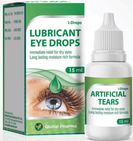
CARBOXY METHYLCELLULOSE SODIUM i-Drops