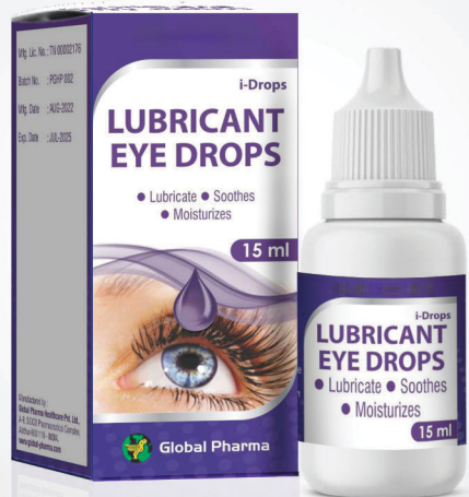
GLYCERIN, HYPROMELLOSE & POLYETHYLENE GLYCOL i-Drops