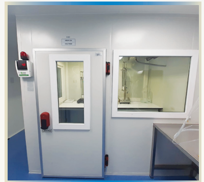
Steril Infusion and Vial Filling