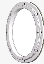
Traceability with RFID chipped glove ports