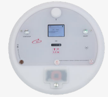
MK Transfer System Tester