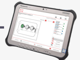
MK software runs on any Windows® system