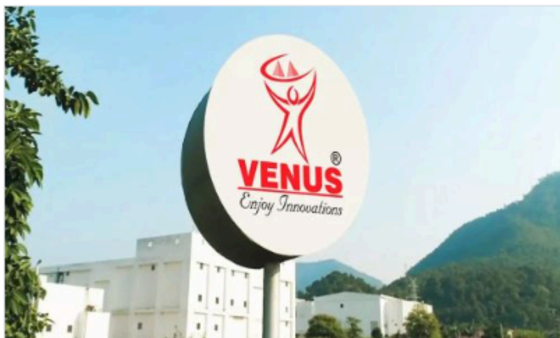
• Venus Remedies Ltd

MediCircle / Press Release / February 25, 2025