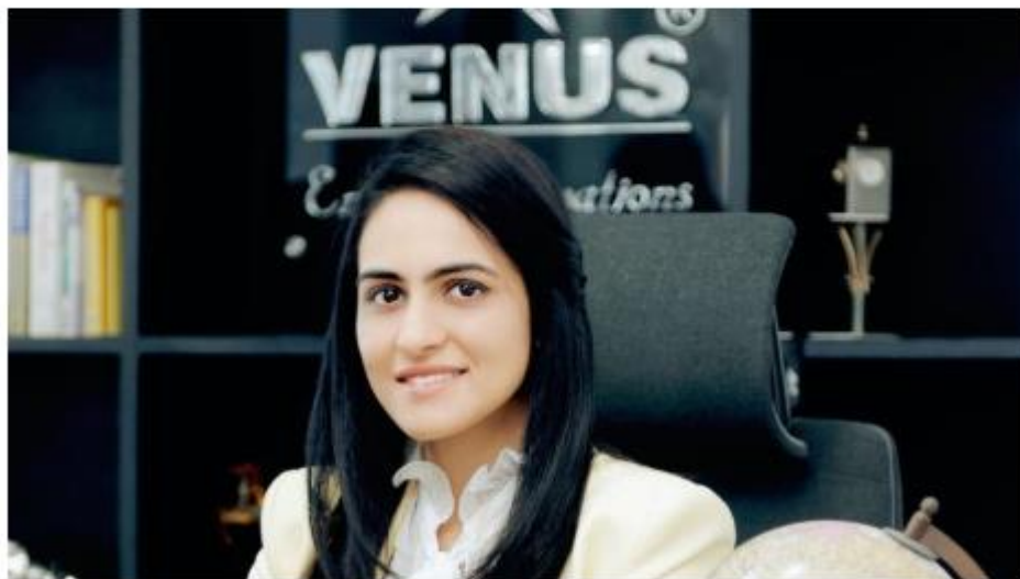
Venus Remedies clinches dual tender from globally acclaimed UNICEF & PAHO