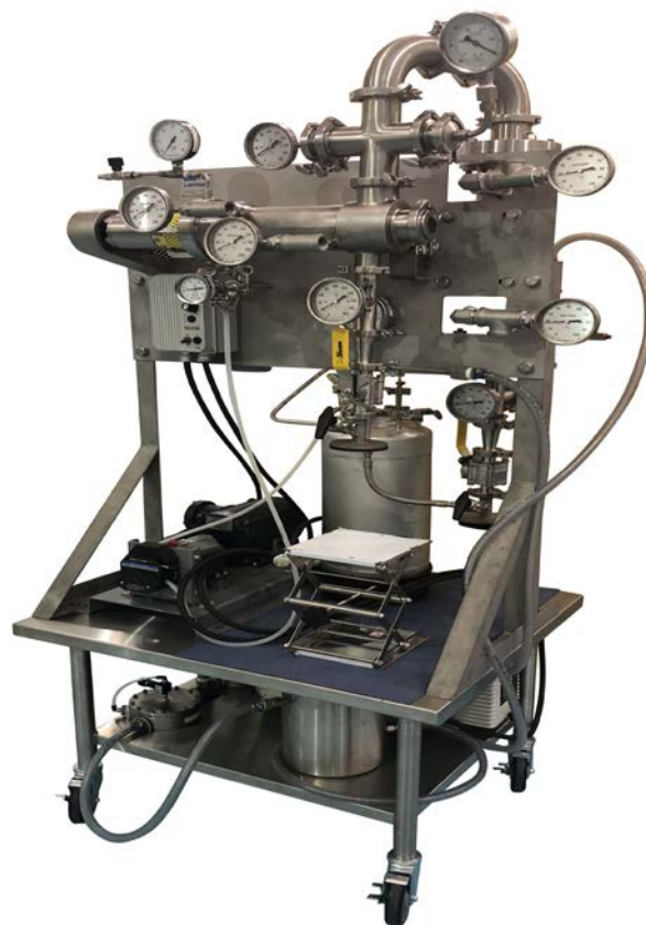
LCI Sanitary Super LabVap® on wheeled cart