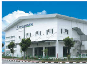
Malaysia (Plant II)