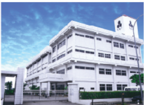
Malaysia (Plant I)

YOUR TRUSTED PARTNER IN MANUFACTURING & DISTRIBUTION