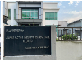
Malaysia (Plant IV)