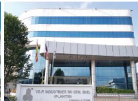
Malaysia (Plant III)