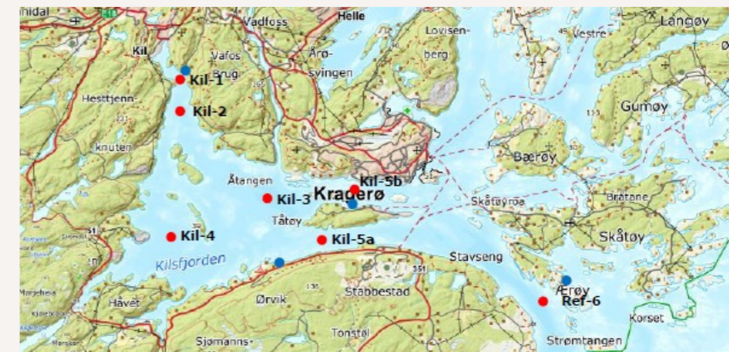
Sampling points in the Kilfjord outside Vistin Pharma facilities to ensure no effluents to sea

Latest results from 2024 shows that Vistin's effect on the sea from our metformin production, is the same as from one diabetes patient per year! We take great pride in these results, as they demonstrate our dedication to sustainability and distinguish us as a responsible and reliable supplier.