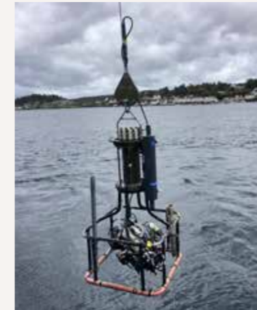
Regular surveillance and sampling of the fjord

To ensure that no effluents reach the sea, we conduct regular sampling at monitoring points in the Kilfjord near our facilities. Since 2017, Vistin Pharma has been part of a national surveillance program that monitors effluents in the environment and their effects on living species.