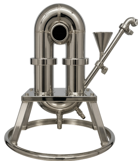
Figure 2. 2" Loop Jet Mill

The feeder setting was kept constant for all trials and the resulting feed rate increased at an almost linear rate with respect to the percentage of SYLOID® XDP 3050