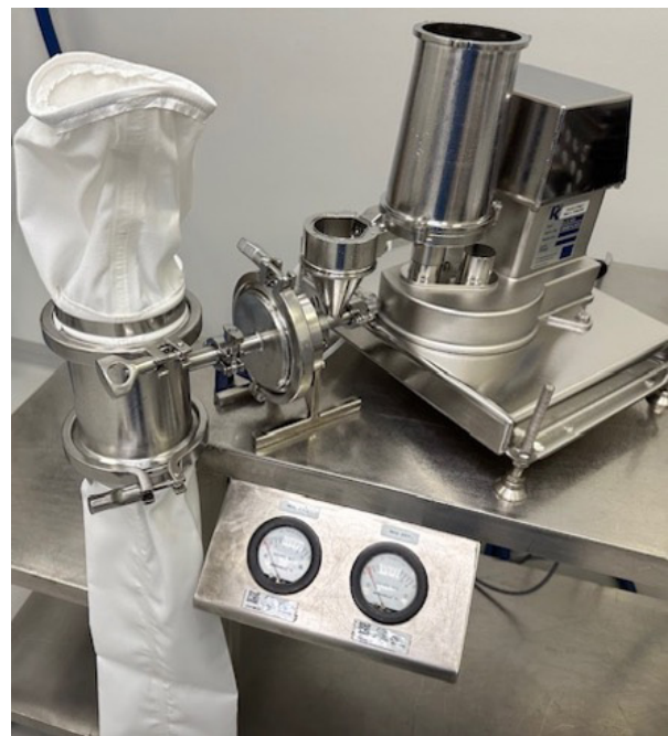
Figure 1. 4" Spiral Jet Mill with Dual Screw Microfeeder

The first experiment focused on increasing Cholesterol's run time in a 4" spiral jet mill. When Cholesterol is micronized at maximum pressure (120 PSI), the process reaches failure mode in 2 minutes, which involves blowback and full obstruction of the mill. Different grades of SYLOID® mesoporous silica at different concentrations were added and tested at two milling pressures. Cholesterol was preblended with SYLOID® mesoporous silica in a suitably sized plastic jar using a Turbula Mixer for 10 minutes prior to micronization. Results are shown in Table 3.